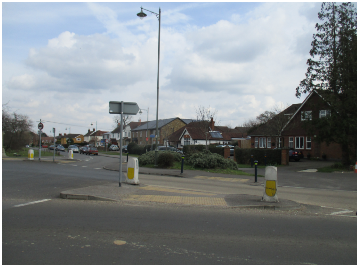
View from Guildford Road of the proposed location.