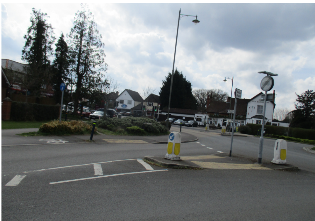
View from the War Memorial along Church Lane of the proposed location where the notice board would be located.