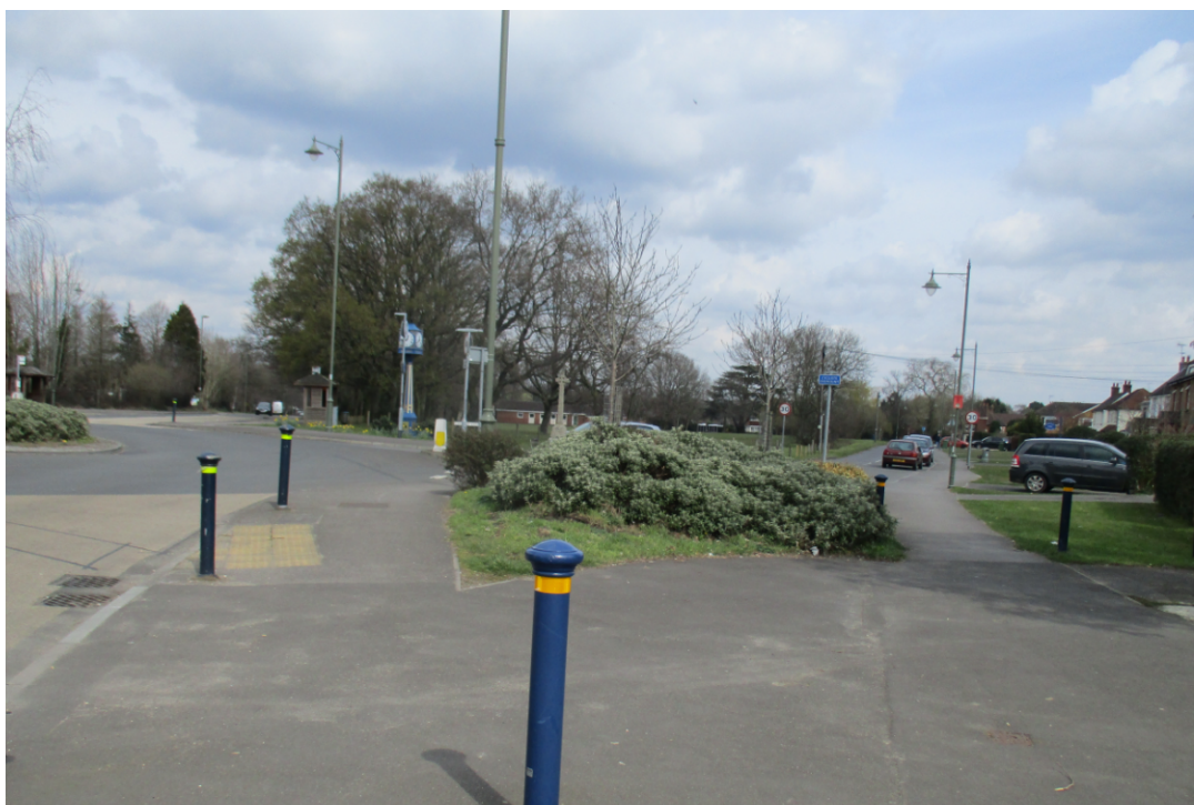
The grassed area of the highway verge at the junction of Guildford Road with Church Lane.